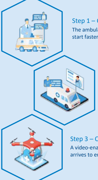
Figure 1: Improving emergency response times

Step 1 – Connected hospital The ambulance takes the patient to the nearest hospital, where specialists are available remotely and treatment can start faster